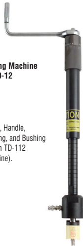
TD-112 Drilling Machine 05-1088-1000-12

Bleeder Valve, Handle, Retainer Spring, and Bushing (included with TD-112 Drilling Machine).