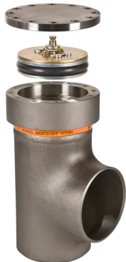
■ Flanged Flat-Bottomed Tees Sizes 4- to 12-in. (DN 100 - 300)

Complete Flanged Flat-Bottomed Tee includes: cover flange, gasket, bolts, plastic cap plugs, completion plug with O-ring and tee.