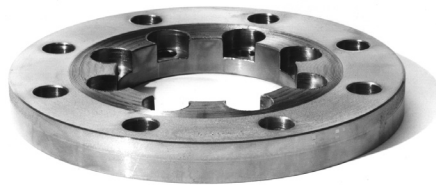
■ Valve-to-Fitting Adapter

*For use with Type IIa flanges only. Consult factory if gaskets are needed for Type II flanges.