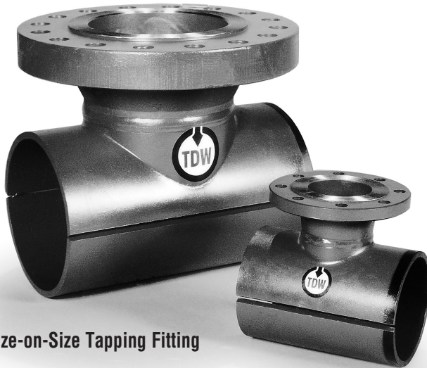
■ Size-on-Size Tapping Fitting