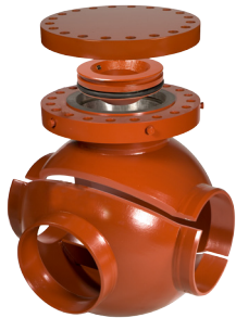
■ 4- through 24-inch