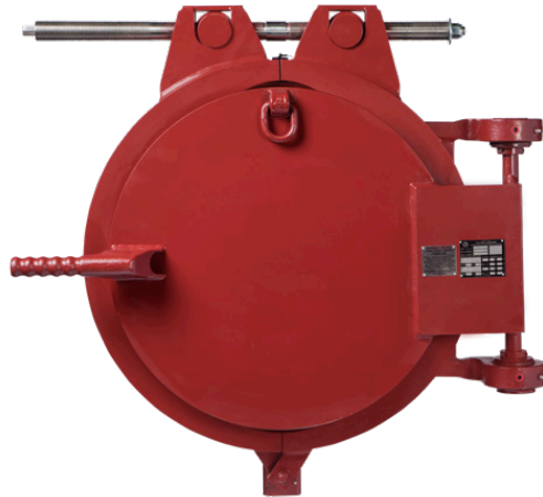
■ D2000 Quick-Actuating Closures