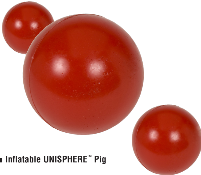
■ Inflatable UNISPHERE™ Pig

Bulletin No: 3010.001.02 Date: January 2007 Cross Indexing No: n/a Supersedes: 3010.001.01 (2/05)