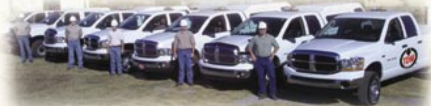
Fully equipped TDW pipeline service fleet