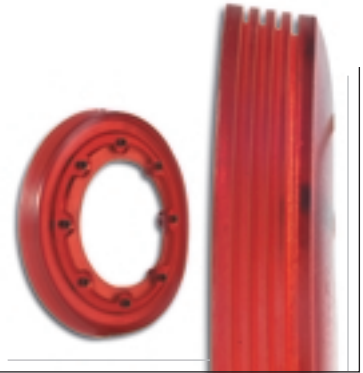
Heavy Duty RealSeal ® cups can be used on WCK, SBN, LBN and PitBoss ™ pigs.

The RealSeal option features multiple sealing lips, which means a more effective seal through the pipeline run. Girth welds in the pipeline allow for multiple leak paths. Using TDW's RealSeal cups and discs seals these leak paths where conventional cups and discs do not. Available in Vantage ® cups, Heavy Duty cups and ULTRA ™ Multi-Lip discs, the RealSeal option allows for flexibility in design of pigs. A TDW representative can assist you in choosing the right configuration.