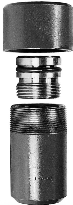
■ THREAD-O-RING™ Fittings