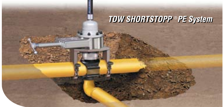
TDW SHORTSTOPP® PE System

Existing SHORTSTOPP® equipment owners simply need to add products to complete the system. Or you can choose TDW's turnkey service option.