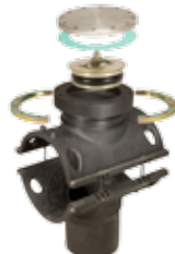
SHORTSTOPP® PE Bottom Branch Outlet Fitting 8- through 12-inch