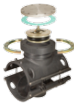
SHORTSTOPP® PE Plugging Fitting 8- through 12-inch