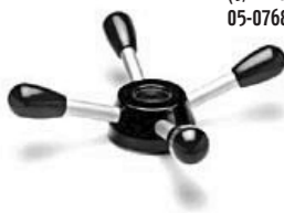
Star Wheel Handle for T-101 XL Drilling Machine (3/4-inch Hex Drive) 05-0768-1025

T-101-XL Drilling Machine 05-1029-0000-00 may be used as an alternative to PS2000XL