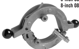
Deluxe Pipe Scraper 4-inch 08-3400-1004 6-inch 08-3400-1006 8-inch 08-3400-1008