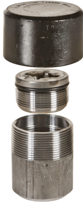
■ Shortstopp® 740 Purge & Equalization Fitting Size 2"