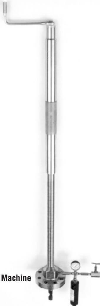
■ 904 Drilling Machine Model 904B