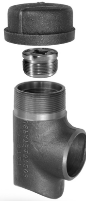
■ 3-WAY™ Tee See Bulletin 2100.002

■ Note: Consult your TDW representative for additional fitting options.