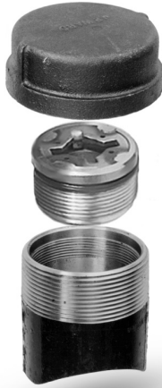
■ Welding Fitting See Bulletin 2100.003