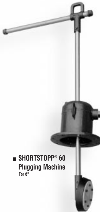
■ SHORTSTOPP® 60 Plugging Machine For 6"