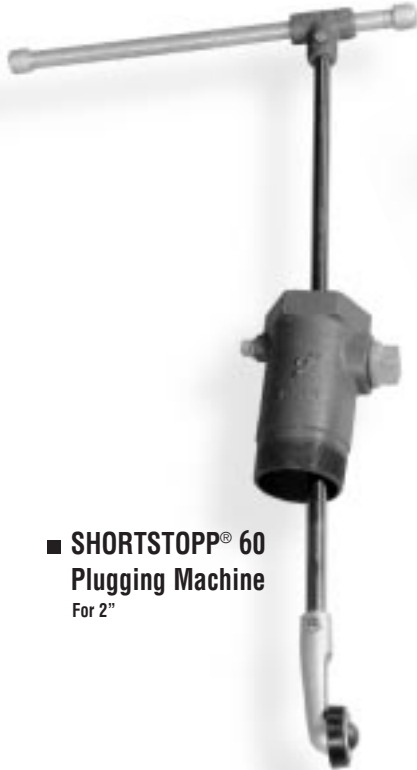
■ SHORTSTOPP® 60 Plugging Machine For 2"