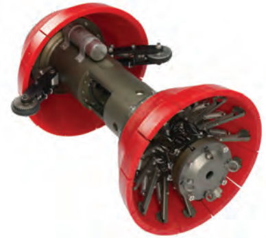
KALIPER® 360 Technology