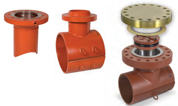
Type III and Full-Encirclement Fittings