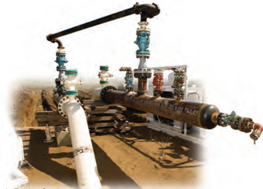
Hydrostatic Testing Services