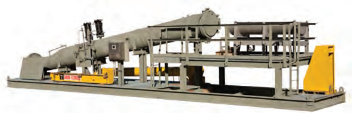
Pig Launchers and Receivers