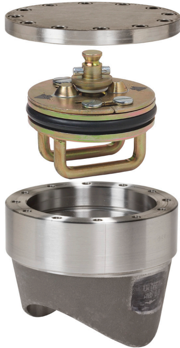
■ SHORTSTOPP® Welding Fittings and SHORTPLUG™ with Guide Bars Sizes: 4- to 12-inch