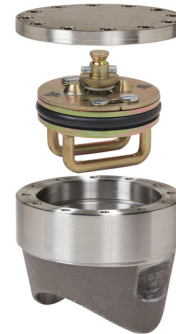
■ 4- to 12-inch Welding fitting includes cover flanges with bolts, gasket and plastic caplugs, SHORTPLUG™ with Guide Bars, O-ring and flanged nipple.