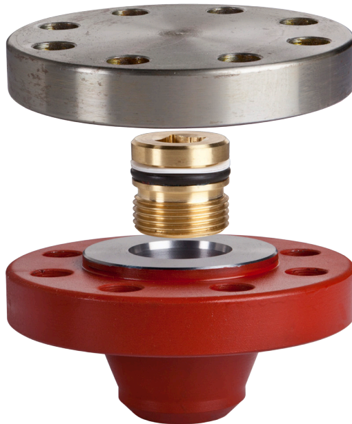
■ THREAD-O-RING™ Flanged Fittings